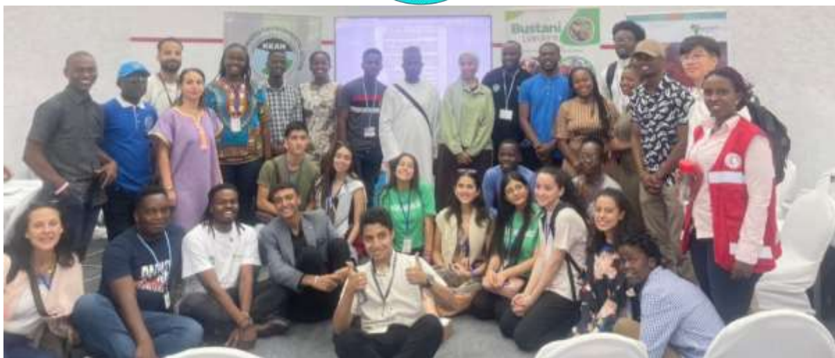
The day ended with the closing ceremony.