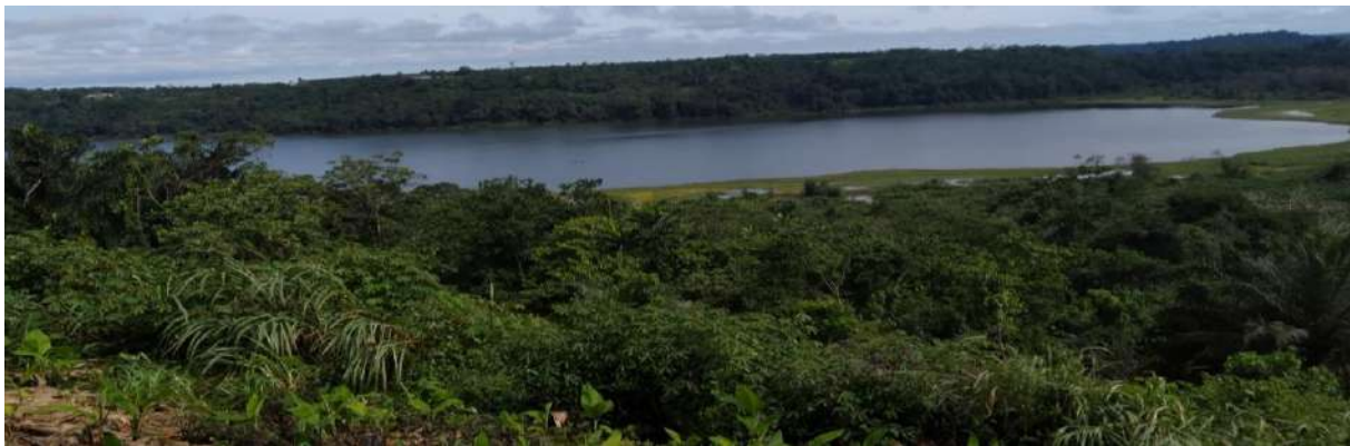
Lake Ossa Wildlife Reserve, Cameroon