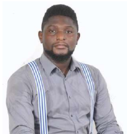
Co-founder/Chief of Operations