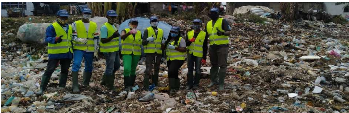
Cleanup event at Pont combi, Douala, Cameroon.