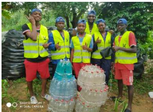
E2F waste Ambassador