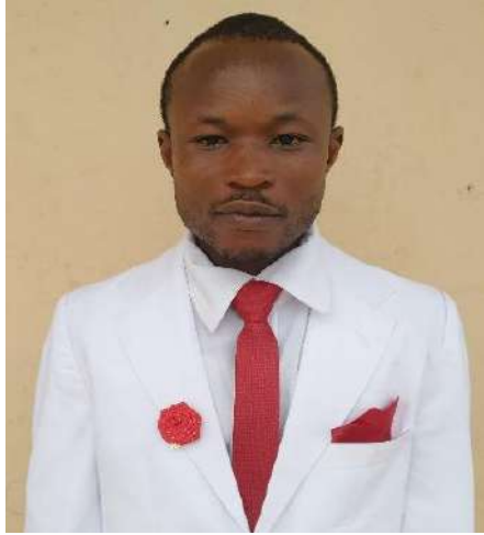
Founder & Executive Director