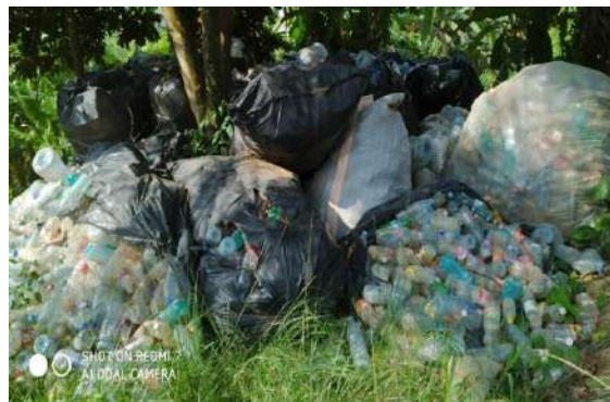
Collected plastic waste bottles