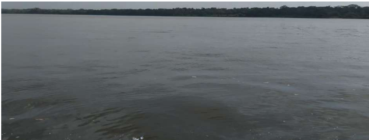
Douala-Edea national park, Cameroon